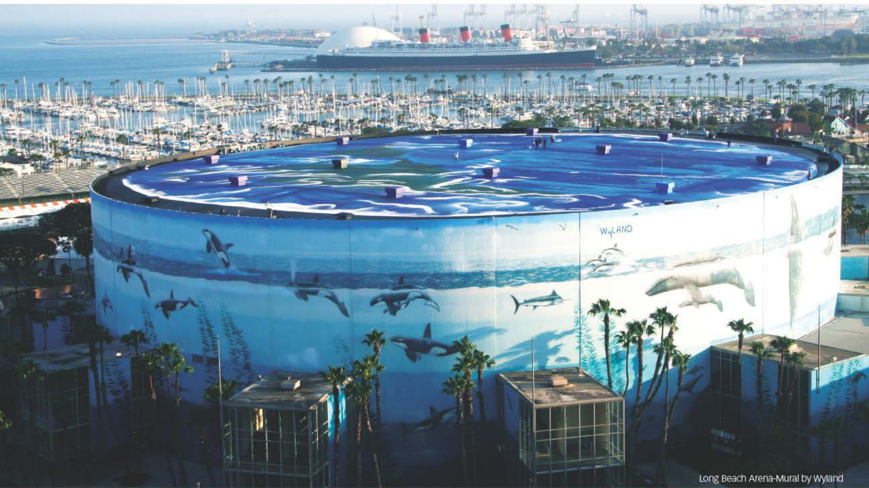
Long Beach Arena-Mural by Wyland

For more info on all things Long Beach: visitlongbeach.com