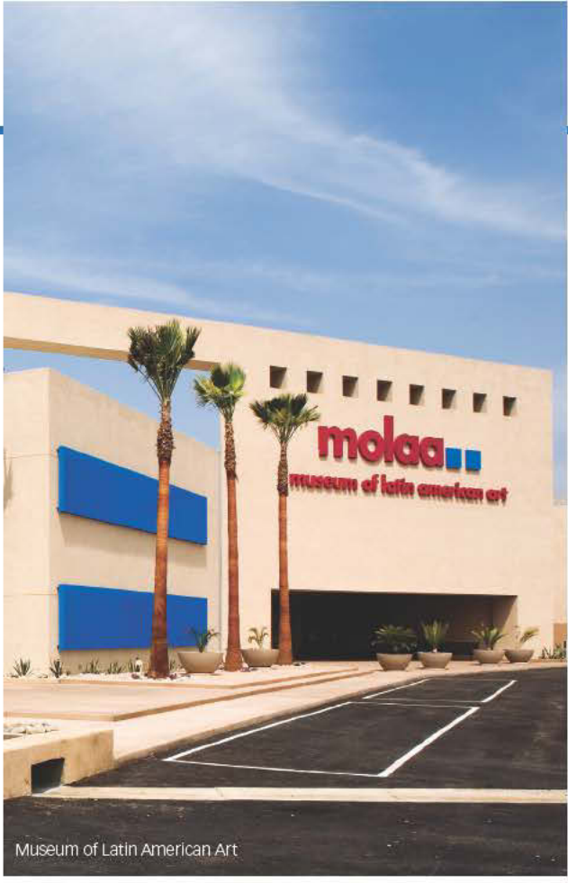
Museum of Latin American Art

the heroes, and most importantly howling with laughter ( allamericanmelodrama.com ). Long Beach's Dinner Detective Mystery Dinner Show is a one-of-a-kind cruise on an old paddle wheeler where laughter reigns supreme and everyone's a suspect, including your table mates ( dinnerdetective.com ). Sgt. Pepper's Dueling Piano Cafe is the place to go if you want the rowdiest time in town where no rules "rule." Singing, clapping, and drink-a-long banter helps folks celebrate anything and everything ( pepperspianos.com ).