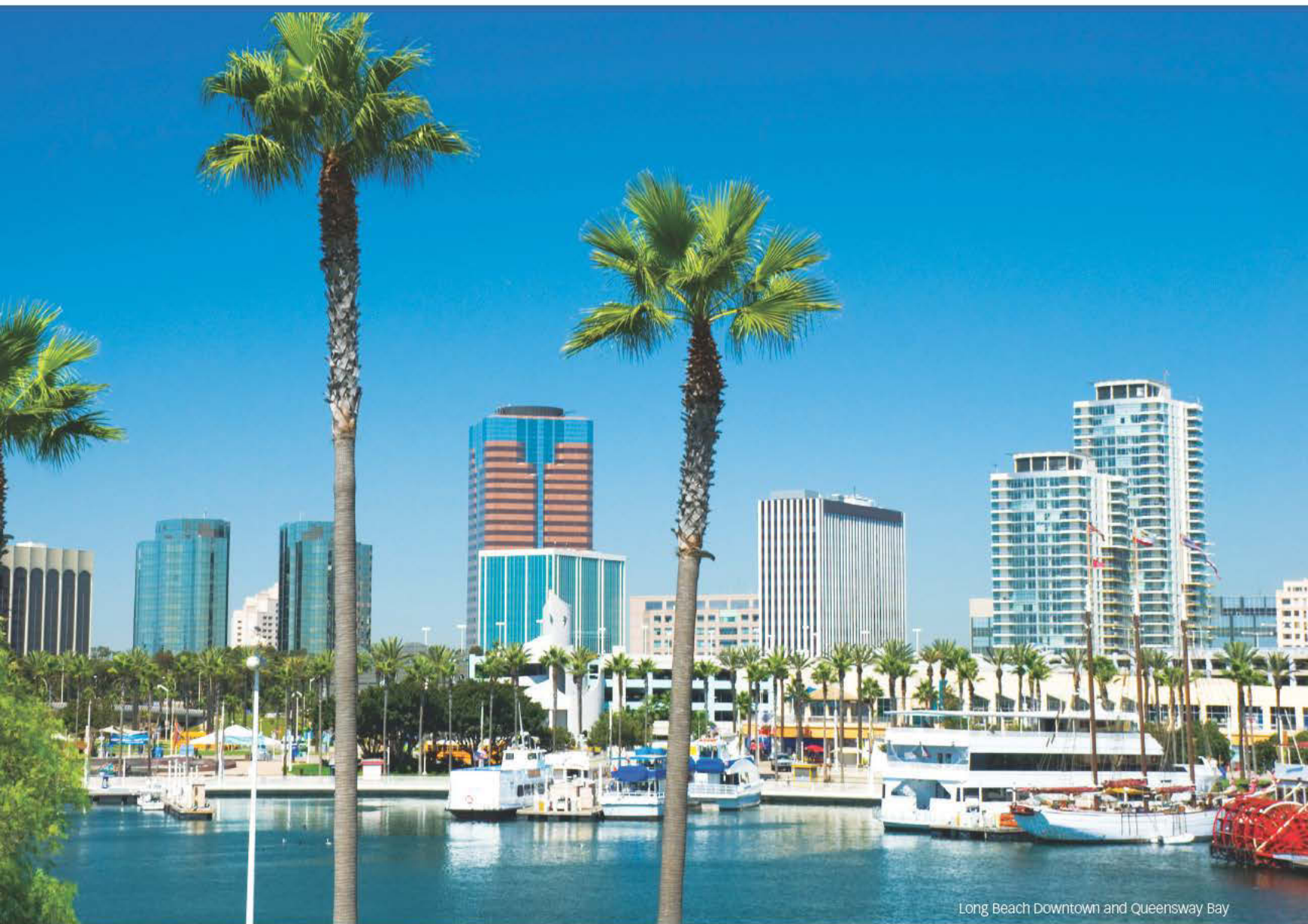
Long Beach Downtown and Queensway Bay