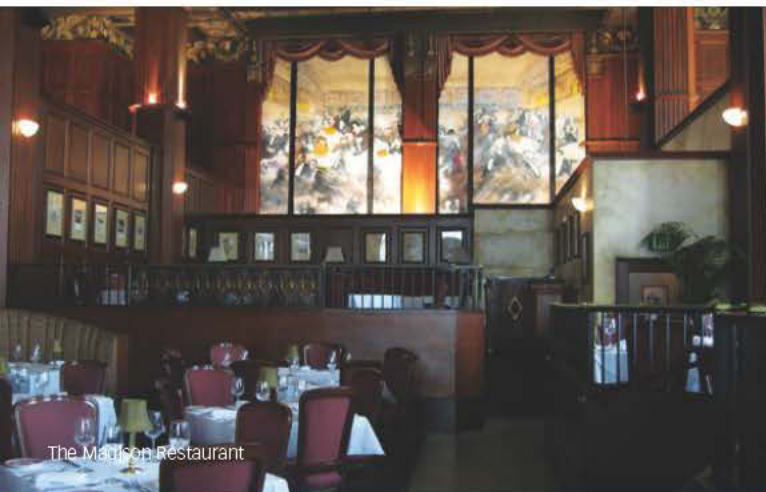
The Madison Restaurant

L'Opera Ristorante on Pine Avenue, the restaurant-row of downtown, is a stellar redo of a former bank, offering exceptional Italian gastronomy