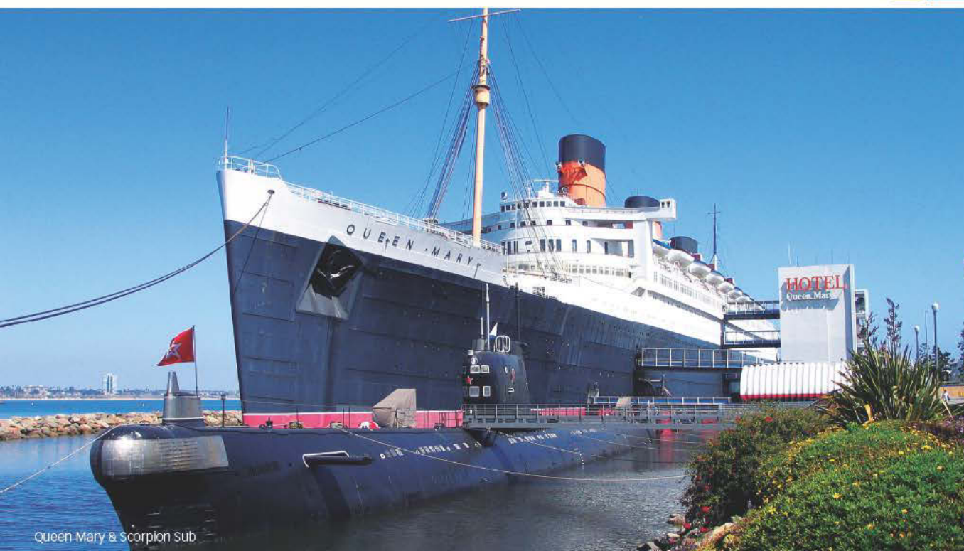
Queen Mary & Scorpion Sub

Since 1967, the Queen Mary, once the world's grandest and fastest ocean liner, has been a significant symbol for the city of Long Beach. And she remains a beloved landmark as travelers from around the globe continue to flock to California's seventh largest city in order to experience her illustrious history. Believe it or not, if she were operating today, we are told she'd still be the speediest cruise liner on the high seas. Today, Long Beach offers plenty for visitors to do and see, both at sea and on land.