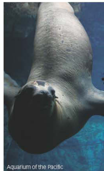
Aquarium of the Pacific